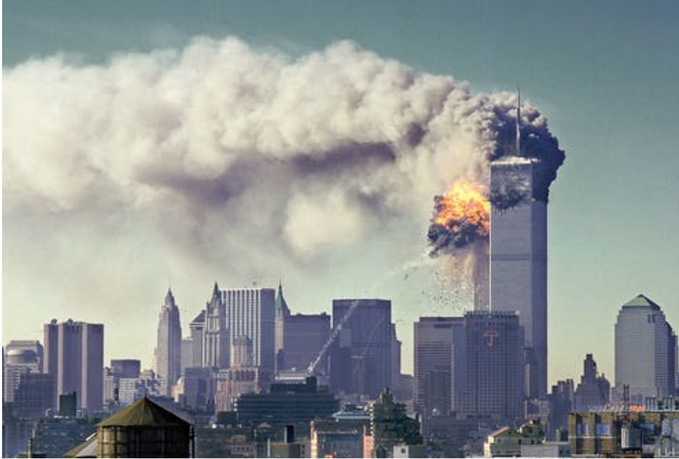
Picture 1: The picture depicts the moment when the two airplanes crashed into the twin towers of the World Trade Center in New York

The International Financial Crisis of 2008 started in the United States of America and it was the consequence of the destruction of the American housing market. Because of this phenomenon the international financial system was almost destroyed while companies related to insurance issues, banks (especially commercial ones), organizations related to loans and saving were closed down. The International Financial Crisis of 2008 has been characterized as the second biggest financial downturn since the Great depression during 1929-1939.