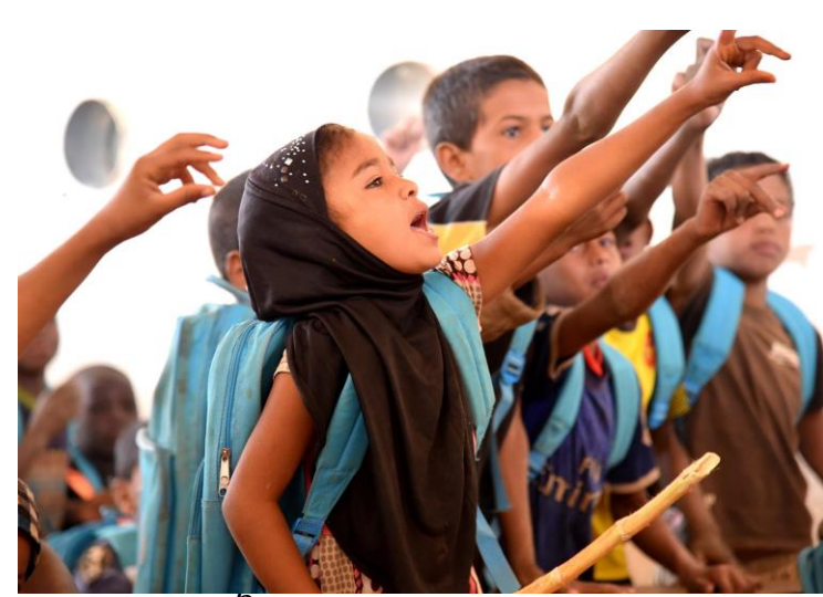
Figure 3: Refugee children from Mali compete to catch their teacher's attention in one of the six primary schools in Mbera refugee camp, Mauritania

prosperity of their families and communities. Unfortunately, refugee girls do not always have the same opportunities as refugee boys. In