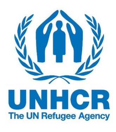
Figure 6: UNHCR's logo

concerning refugees and crises management. Especially in education, has addressed many of its UN organisations (UNHCR, UNESCO and UNICEF) to take initiative and tackle the great problem of uneducated people. Concerning refugees' access to education, UNHCR plays an active role in reporting and funding many programs in order to eliminate the issue. For instance, Missing Out and Left Behind