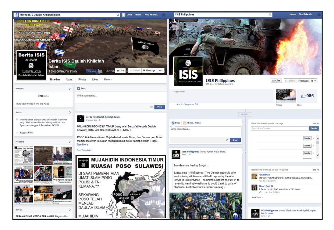
Figure 3: ISIS Facebook pages in Indonesia and the Philippines

in order to achieve the optimum results.