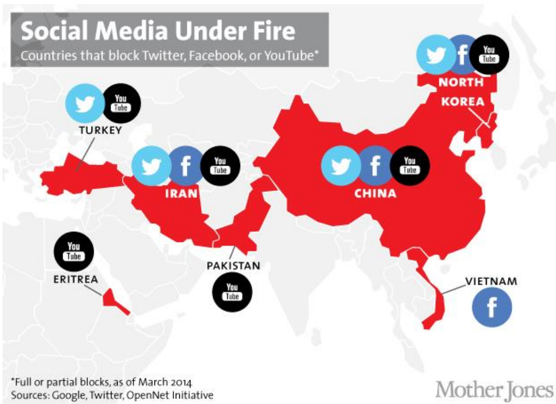
Figure 2: Countries where several social media have been banned

inaugurated a new era of more effective activism. Many independent activists take advantage of the Internet and its digital tools like social media to spread ideas and contribute to the mobilization of other open-minded people across the globe. Arguably, the age of communication is capable of offering activism plenty of benefits, but at the same time it can adversely enhance the efforts of repressive regimes to deprive citizens of information and communication.