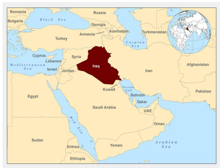
figure 1: Map of Iraq in relation to countries in the Middle East

Iraq is a country located in the heart of the Middle East and bordering with Jordan, Saudi Arabia, Syria, Turkey, Kuwait and Iran. Iraq has one of the richest histories in the world since the territories of modern day. The state of Iraq that we know today was created in the post World War I era, when it was one of the parts of the Ottoman empire that was given to the British Empire after the end of the war. Political instability and lack of peace have always been relevant in Iraq, since it has been one