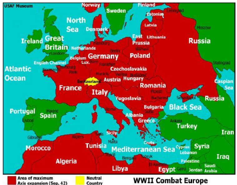
figure 2: Map of influence of the Axis and Ally powers

British established and supported a Hashemite monarchy that ruled Iraq for the 17 years it was under the British influence. In 1932, Britain’s mandate ended, with Iraq gaining its independence. Even though the British had no formal association with the Iraqi government, the two nations continued having close economic and military relations. The close relations that the two nations maintained led to multiple uprisings and revolts that climaxed with a pro-Axis power