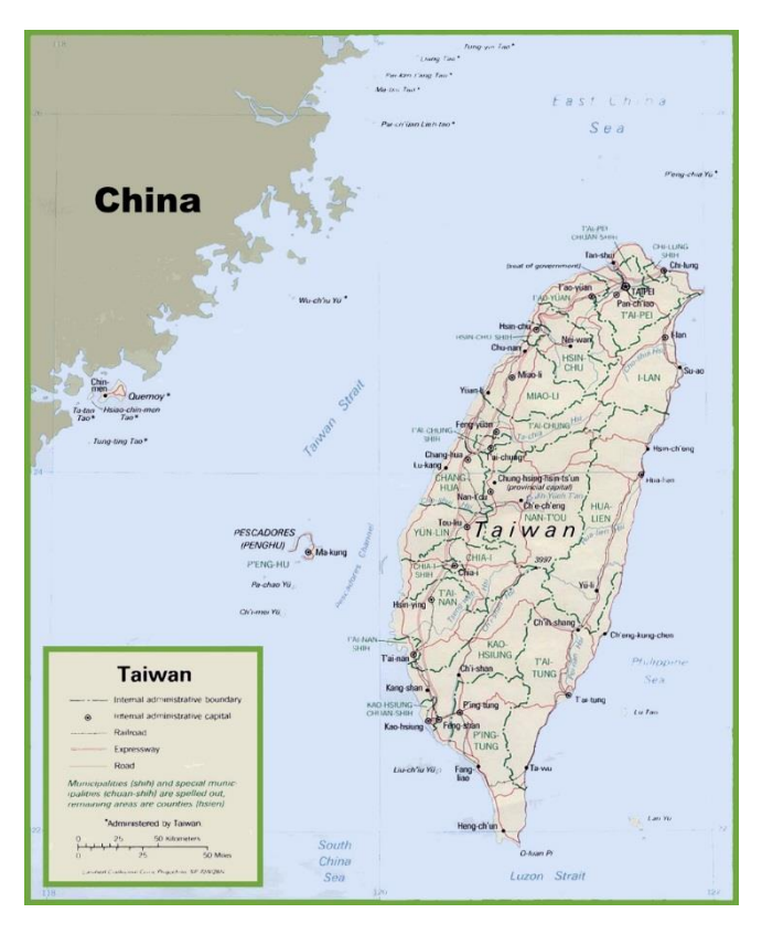
Figure 1: Taiwan political map

governors of all China, internationally the ROC is widely recognized as a part of China.